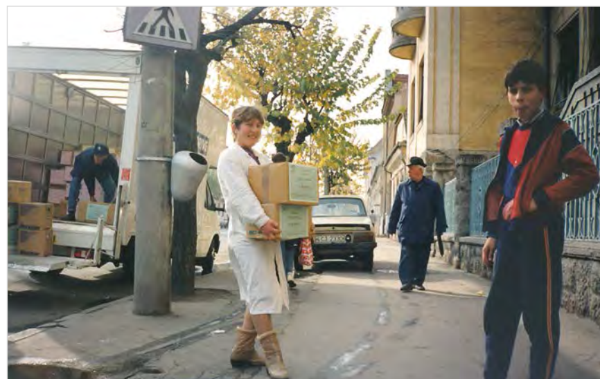
Delivering medical equipment to a Romanian children's hospital 20+ years ago.