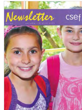
A recent format (2013).