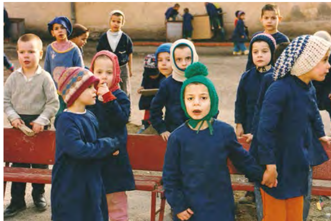
A Romanian orphanage visited by the CSF in 1992.