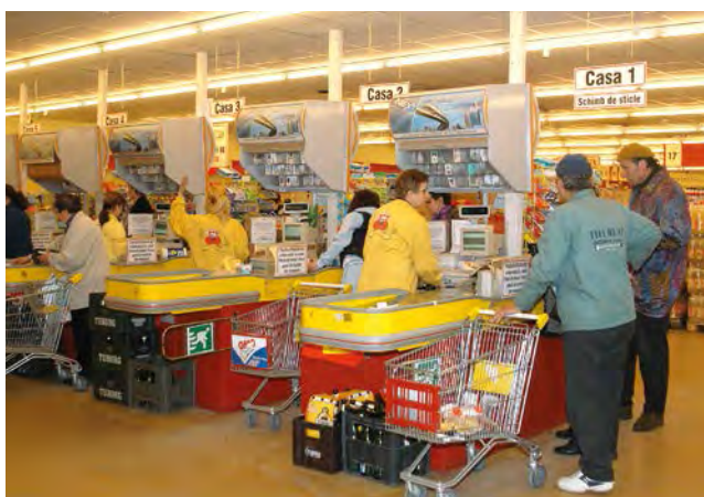
The Romanian Magazin has changed dramatically in recent years.