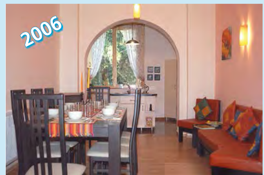
Right Life Skills Room