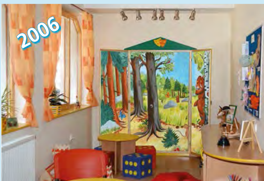
Left Classroom with role-play screen