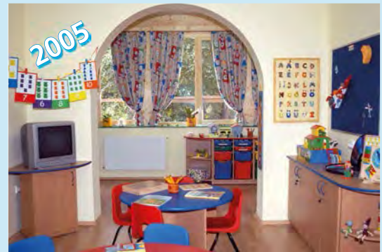
Right Reception Classroom