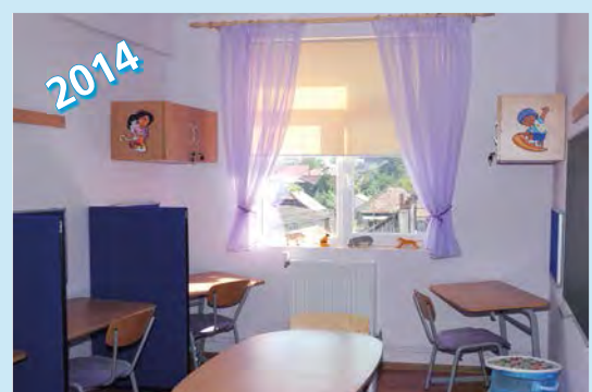
Right Therapy Room (autism)