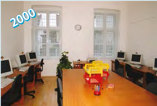
Left Computer Room

Here we show a few pictures of upgraded rooms that are representative of the scope of our work over the 15-year period.