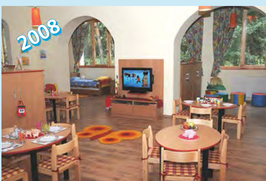
Left Kindergarten Residence