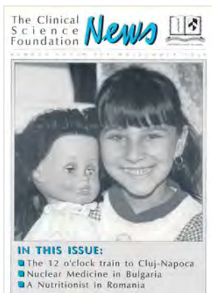
A change of format (1995).

We started to produce Newsletters in October 1991, one year after our first visit to Romania. We wanted to let our supporters know what we were doing with their money and what life was like in Romania. The first issue was on A5 paper (half the size of this page), 20 pages long, with 9 short articles and 11 pictures. In 1995 we changed to an A4 format, with improved printing. Now, a typical Newsletter will have probably ten long articles and over 30 images. Here we present a few extracts from memorable past articles.