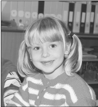
Kindergarten girl at School for the Deaf No. 2